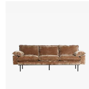
MAKE TO ORDER Retro sofa: 3-seater