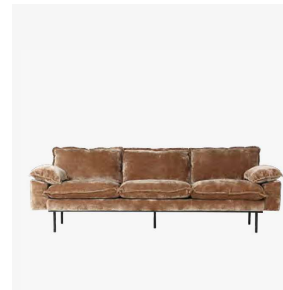
MAKE TO ORDER Retro sofa: 4-seater

Composition faceside: 95% polyester, 5% polyamide Material weight: 600 g/lm Abrasion resistance (EN ISO 12947 I&2): 100.000 cycles, martindale Pilling resistance (EN ISO 12945-2): class 4 Lightfastness (EN ISO B02): class 5